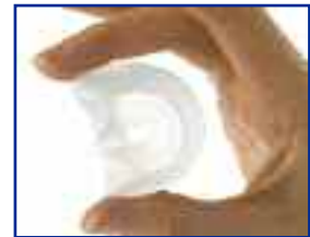
Ideal size and height

Dermacol is a unique stoma collar that provides a leakproof barrier around the base of your stoma, preventing output from coming into contact with the skin. Unlike any other product, the Dermacol stoma collar forms a physical barrier to prevent output from coming into contact with the delicate skin around your stoma, protecting you from discomfort and giving you extra peace of mind. It's suitable for use with all types of appliances.