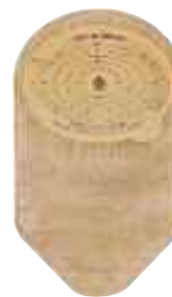
* Oval wafer.

* Oval wafer pouches can be cut up to 110mm wide and 70mm deep.