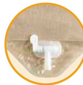
Positive action, wide-bore on/off tap with integral drip cap.