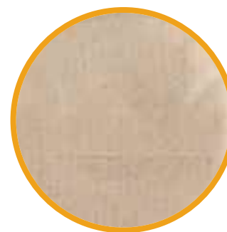
Overlapping fabric for easy positioning.